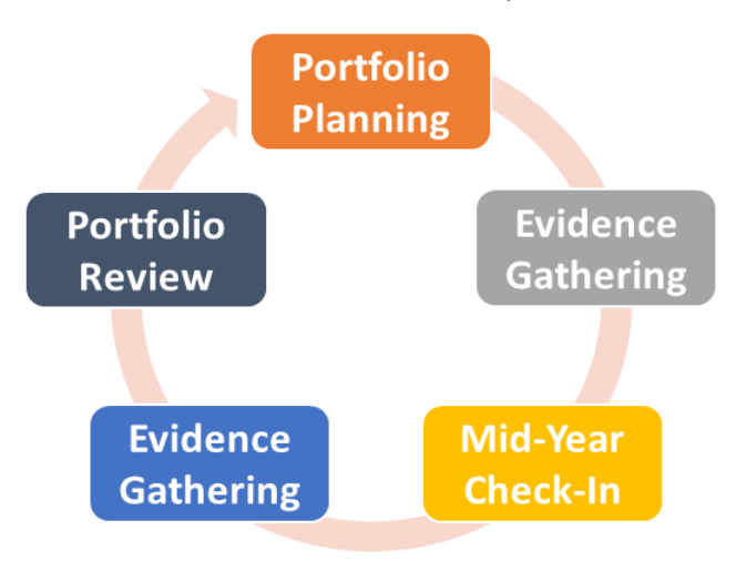
Figure 1: Principal Portfolio Process. This figure depicts the portfolio cycle for principals.

The Principal Portfolio process encourages collaboration with the superintendent and reflection. Each principal engages in planning, collecting artifacts and sharing a portfolio to demonstrate exemplar performance on all Five Essential Practices of School Leadership.